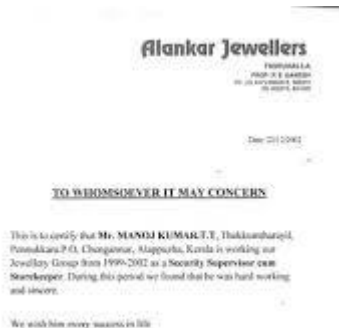
Figure Work experience certificate 2 | PDF

Experience certificate | PDF , Apr 8, 2017 — This certificate confirms that [name] worked as an HR Officer from [date] to [date] in this organization. She is described as a very sincere ... slideshare net/slideshow/experience-certificate-74727552/74727552