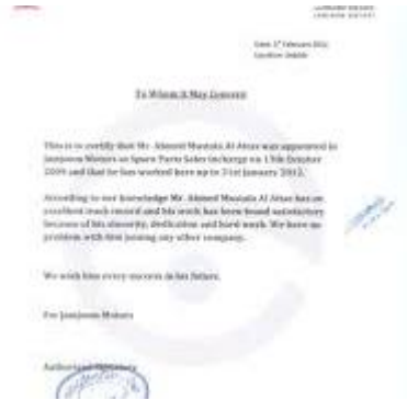
Figure Experience Letter | PDF

Experience Letter Sample | PDF , Sep 22, 2018 — Experience Letter Sample - Download as a PDF or view online for free. slideshare net/slideshow/experience-letter-sample/115958341