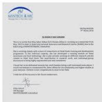
Figure Work experience letter | PDF

Experience Letter | PDF , Jul 20, 2016 — Experience Letter - Download as a PDF or view online for free. slideshare net/slideshow/experience-letter-64234093/64234093