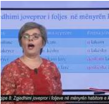
Figure Gjuhë shqipe 8 - Zgjedhimi jovepror i foljeve në mënyrën habitore e kushtore Gjuhë shqipe 8 - Zgjedhimi jovepror i foljeve në mënyrën ... , ... forma më e re e këtij sistemi. Me anë të saj mund të ... Format foljore të mënyrës habitore janë mjaft të përdorura, sadoqë jo sa në shqipen e sotme. youtube com/watch?v=CggSeCK6nBo