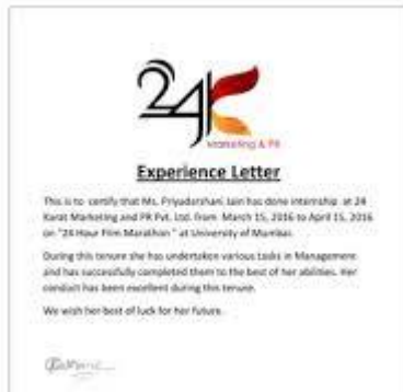
Figure Experience Letter | PDF

What is the document for work experience? an employment contract or appointment decision, including any subsequent amendments to the job title where applicable; a payslip showing your contractual working hours; a statement from your employer; a statement from an accountant or an accounting firm, if you carried out the work in a self-employed capacity.