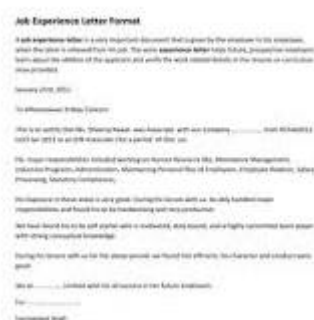
Figure Job Experience Letter Format | PDF

Job Experience Letter Format | PDF , Dec 8, 2013 — Job Experience Letter Format - Download as a PDF or view online for free. slideshare net/slideshow/job-experience-letter-format/29032332