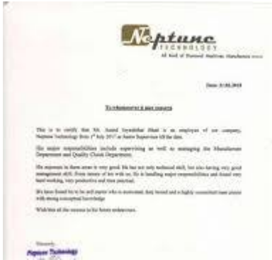
Figure Neptune technology work experience letter | PDF

Experience Letter Sample | PDF , Sep 22, 2018 — Experience Letter Sample - Download as a PDF or view online for free. slideshare net/slideshow/experience-letter-sample/115958341