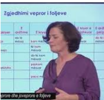
Figure Gjuhë shqipe 9 - Forma veprorë dhe joveprorë e foljeve habit | Zgjedhimi në të gjitha mënyrat dhe kohët , Edhe kjo kohë e habitores del me forma sintetike të përfituara duke i ... Format gramatikore të mënyrës lidhore Folja e përdorur në mënyrë lidhore ... fjalorthi com/zgjedho/habit

Format e shtjelluara të foljes , Mënyra Dëftore. E tashmja: laj, lan, lan, lajmë, lani, lajnë · Mënyra Lidhore. E tashmja: të laj, të lash, të lajë, të lajmë, të lani, të lajnë · Mënyra Habitore ... sq wikipedia org/wiki/Format_e_shtjelluara_t%C3%AB_foljes