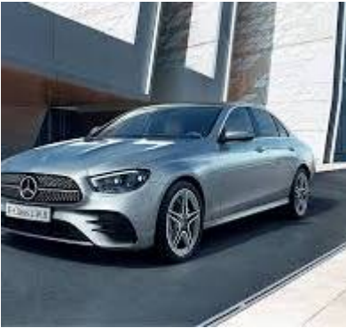
Figure Mercedes-Benz E-Class Exclusive E 200 On Road Price (Petrol ...

Mercedes Benz GLA 2024 Harga OTR, Promo Juli, Spesifikasi & Review , Mini MINI Clubman Final Edition 2023 · Rp. 24.980.000 · Rp. 256.200.000. Harga OTR JABODETABEKA. oto.com/mobil-baru/mercedes-benz/gla-class#:~:text=Harga Mercedes Benz GLA di,dimulai dari Rp 975 Juta