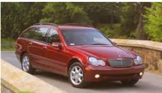
Figure 2004 Mercedes-Benz C-Class Review & Ratings | Edmunds

Mercedes-Benz S-Class - Wikipedia , 2004 Mercedes-Benz C-Class Review ; 4.7 out of 5 stars. 215 Owner Reviews ; 19 mpg. Combined MPG ; $244/mo. Cost to Drive ; 4 yr / 50,000 mi. Original Warranty. en wikipedia org/wiki/Mercedes-Benz_S-Class#:~:text=The Mercedes%2DBenz S%2DClass,the German automaker Mercedes%2DBenz