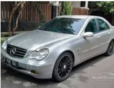
Figure Jual Mercedes-Benz C-Class Harga Rp60 Juta - Rp120 Juta Bekas di Indonesia Harga Kredit Murah | Mobil123

Dimensions ; Rear-wheel drive. Drivetrain ; Overview. 4.4. (45 reviews). The good: Performance with 3.2-liter V-6 ... olx.co.id/jakarta-dki_g2000007/mobil-bekas_c198/q-mercy-2004?filter=make_eq_mobil-bekas-mercedes-benz