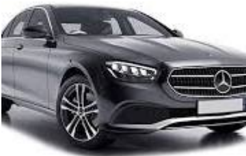
Figure E-Class E 200 Exclusive on road Price | Mercedes-Benz E-Class E 200 Exclusive Features & Specs Mercedes-Benz E 200 Avantgarde Line 2024 , E-Class W213 Facelift ; Tipe, Harga ; E200 Avantgarde Line, Rp. 1.325.000.000,- ; E300 AMG Line, Rp. 1.665.000.000,- ; E200 Coupe AMG Line, Rp. 2.030.000.000,-. kreditkerenbanget.com/detail-car/mercedes-benz-sedan-e-200-avantgarde-line-2024?location=36

Jual Mercedes-Benz E-Class E200 Bekas di Indonesia ... , Driver's seat, electrically adjustable with memory function. Folding rear-seat backrests. Multifunction steering wheel in Nappa leather. mobil123.com/mobil-dijual/mercedes-benz/e-class/e200/indonesia