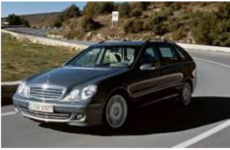
Figure 203 series C-Class Estates, 2004 - 2007

Used C-Class 2004 and newer Car Prices in Indonesia , 2004 C-Class specs (horsepower, torque, engine size, wheelbase), MPG and pricing by trim level. oto.com/en/mobil-bekas/mercedes-benz-c-class+2004