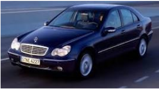
Figure 2004 Mercedes-Benz C-Class review: Used car guide - Drive

What does S & C mean on my Auto gears , 1 Used Mercedes Benz C-Class Cars available for sale in Indonesia starting from Rp 95 Million. Get great deals on good condition used Mercedes Benz C-Class cars ... forums mercedesclub org uk/index php?threads/what-does-s-c-mean-on-my-auto-gears 85640/#:~:text=If it is a W204,and the C means %22Comfort%22