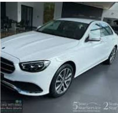
Figure E200 Avantgarde Line FL 2024 - Mercedes Benz Jakarta

Mobil Mercedes Benz C200: Harga, Spesifikasi, dan Kelebihan - Otoklix , Harga Mercedes-Benz E 200 terbaru July 2024 mulai dari Rp 1.14 Milyar. Sebelum beli, dapatkan info spesifikasi, konsumsi BBM, promo diskon dan simulasi ... otoklix.com/blog/spesifikasi-dan-harga-mercedes-benz-c200/#:~:text=Kamu bisa membeli mercedes benz,tahun 1989 oleh Olivier Boulay