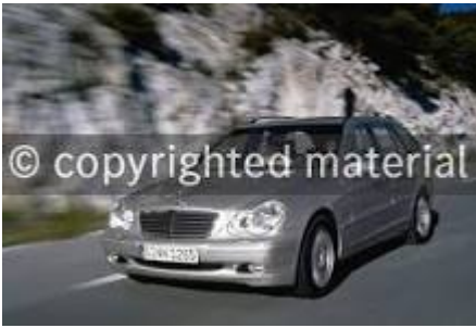
Figure 203 series C-Class Estates, 2001 - 2004

2004 Mercedes-Benz C-Class Pricing and Specs , Trim. Price. Kompressor Hatchback. $25,300. Base Hatchback. $27,650. C230 Kompressor Sedan. $28,490. C240 Sedan. $31,560. C240 4MATIC AWD Sedan. $32,760. autoblog.com/buy/2004-Mercedes-Benz-C-Class/specs/