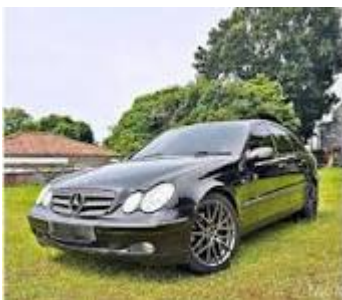
Figure Mercedes Benz C Class - Mobil mercedes benz c class 2004 ...

2004 Mercedes-Benz C-Class Review - Edmunds , The Mercedes-Benz C-Class is a series of compact executive cars produced by Mercedes-Benz Group AG. Introduced in 1993 as a replacement for the 190 (W201) ... edmunds.com/mercedes-benz/c-class/2004/review/