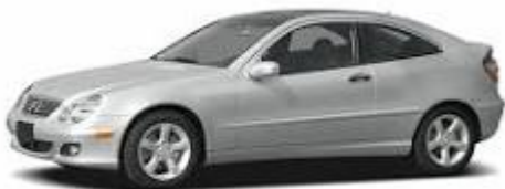
Figure 2004 Mercedes-Benz C-Class Specs, Price, MPG & Reviews | Cars.com

2004 Mercedes-Benz C-Class Consumer Reviews - Cars.com , Mercedes-Benz A-Class · Mercedes-Benz B-Class · Mercedes-Benz C-Class · Mercedes-Benz CLC-Class · Mercedes-Benz CL · Mercedes-Benz CLK · Mercedes-Benz CLS 350 ... cars com/research/mercedes_benz-c_class-2004/consumer-reviews/#:~:text=Sporty%2C yet classy&text=It is sporty%2C with plenty,Interior 5 0