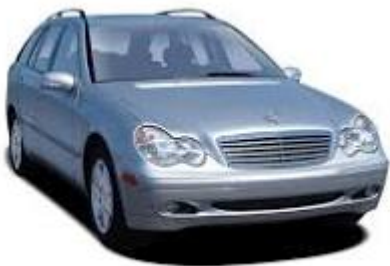
Figure 2004 Mercedes-Benz C-Class Prices, Reviews, and Photos ...

What does S & C mean on my Auto gears , 1 Used Mercedes Benz C-Class Cars available for sale in Indonesia starting from Rp 95 Million. Get great deals on good condition used Mercedes Benz C-Class cars ... forums mercedesclub org uk/index php?threads/what-does-s-c-mean-on-my-auto-gears 85640/#:~:text=If it is a W204,and the C means %22Comfort%22