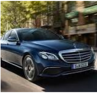
Figure E 200

Jual Mercedes-Benz E-Class E200 Bekas di Indonesia ... , Driver's seat, electrically adjustable with memory function. Folding rear-seat backrests. Multifunction steering wheel in Nappa leather. mobil123.com/mobil-dijual/mercedes-benz/e-class/e200/indonesia