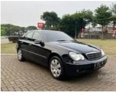
Figure Mercedes Benz C Class - Mobil mercedes benz c class 2004 ...

Used C-Class 2004 and newer Car Prices in Indonesia , 2004 C-Class specs (horsepower, torque, engine size, wheelbase), MPG and pricing by trim level. oto.com/en/mobil-bekas/mercedes-benz-c-class+2004