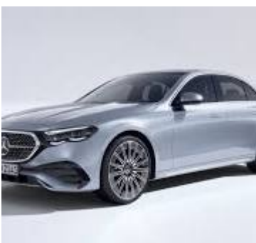
Figure E-Sensi Sedan Mercedes-Benz Mercedes-Benz ...,LEGO Technic 42043 Mercedes-Benz Arocs 3245 RC ...,LEGO 42043 Mercedes Arocs SBrick RC Mod Instructions,LEGO Technic 42043 RC MOD Instructions - B model ...,Lego

Mercedes-Benz E 200 2024 Harga Promo, Spesifikasi ... , 2023 Mercedes-Benz E200 2.0 AMG Line Coupe. Fasilitas yang Anda dapatkan: - Free Service 5th - Warranty 3th ( Unlimited Km ) - ... carmudi.co.id/mobilbaru/merek/mercedes-benz/e-200/