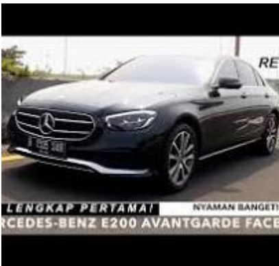
Figure TES LENGKAP MERCEDES-BENZ E200 FACELIFT PERTAMA DI INDONESIA. LEBIH MURAH DR C-CLASS TP LEBIH NYAMAN

Figure E-Class E 200 Exclusive on road Price | Mercedes-Benz E-Class E 200 Exclusive Features & Specs Mercedes-Benz E 200 Avantgarde Line 2024 , E-Class W213 Facelift ; Tipe, Harga ; E200 Avantgarde Line, Rp. 1.325.000.000,- ; E300 AMG Line, Rp. 1.665.000.000,- ; E200 Coupe AMG Line, Rp. 2.030.000.000,-. kreditkerenbanget.com/detail-car/mercedes-benz-sedan-e-200-avantgarde-line-2024?location=36